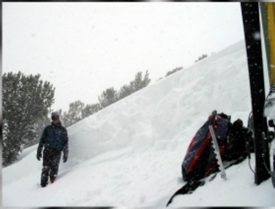
This is an avalanche triggered by two experienced avalanche forecasters while digging a snow pit. Conducting stability tests in avalanche terrain is inherently dangerous since it exposes the observer to the potential of being caught in an avalanche.