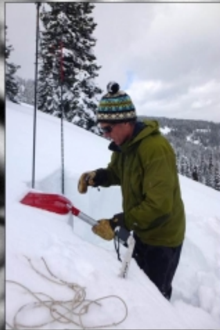
We tested the effect of slope angle on compression tests (CTs) using similar methods as recent ECT work. We collected field data on three separate days with persistent weak layers. Our slopes exhibited gradual changes in steepness, allowing us to sample a variety of slope angles with minimal snow structure changes.